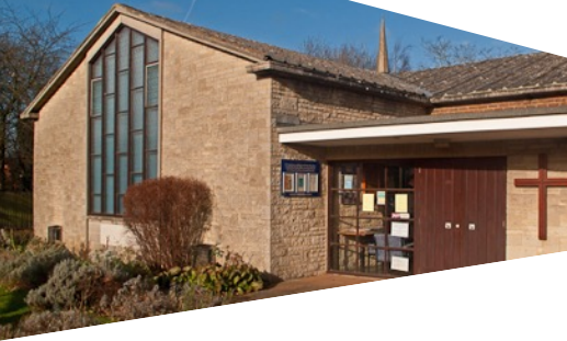
St Wilfrid's Church, Horley Row, since 1958

Now a century after the Great Restoration, the spire and parts of the roof are in need of urgent repair once again. This work will be completed in phases under the expert guidance of Diocesan architects and English Heritage. As a Grade I listed building, all work completed has to be carried out to a particular specification and hold true to the original methods and materials used.