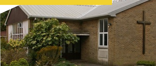
St Francis' Church Balcombe Road, since 1958