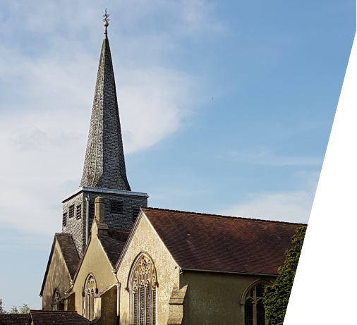
St Bartholomew's Church, Church Road, since 1218

The Parish Anniversary Year has a succession of events to help us celebrate this milestone in the life of the church.